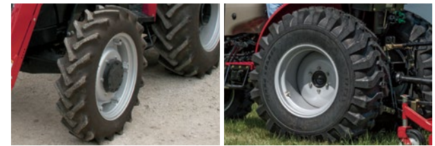
R1 tire – standard tread, agricultural application